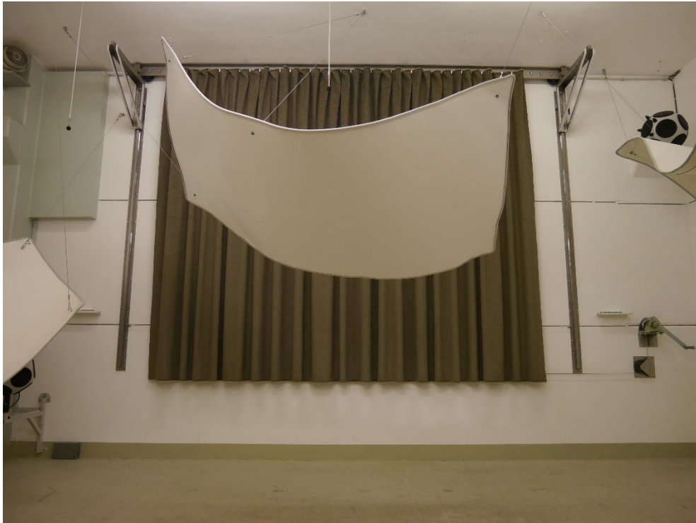
Figure B.1. Test object mounted in the reverberation room, frontal view.