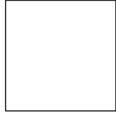
Check box: 5 x 5 cm