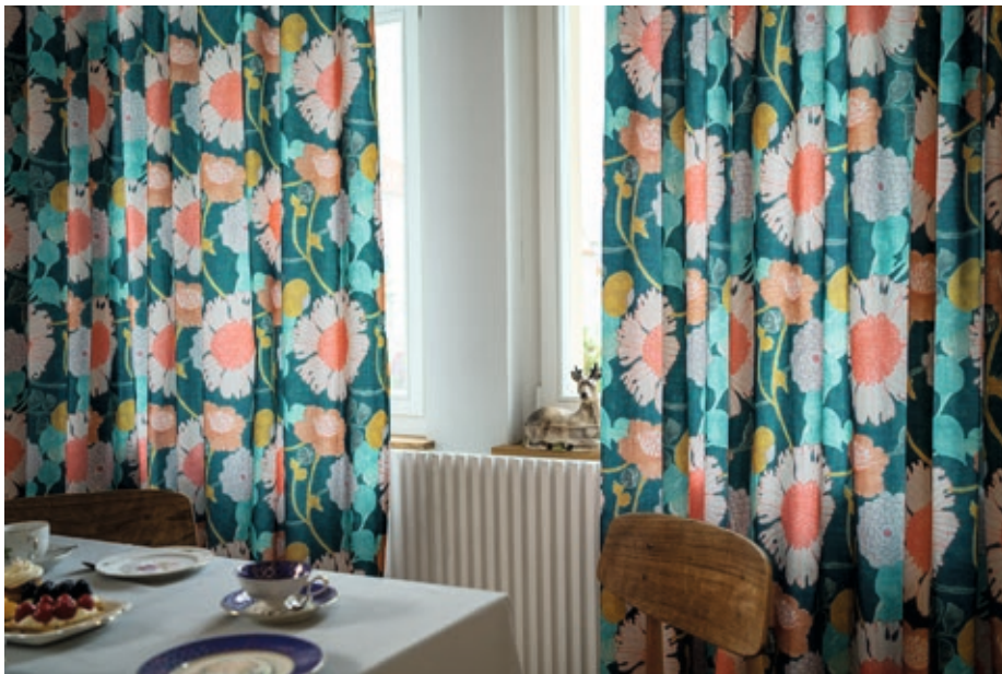
Floral print, room-height, weight tape, fabric width: 280 cm, 4 colours, 100 % PES

FLANEUR – A snapshot of an idyllic garden. Floral design and fresh colours invite you to take a stroll within your own four walls. Enjoy this modern ambience in floral aqua/lobster against a striking dark petrol background, orange/blue against a fascinating sage green, turquoise/terracotta against an elegant silver-grey or green/yellow against a pure white background.