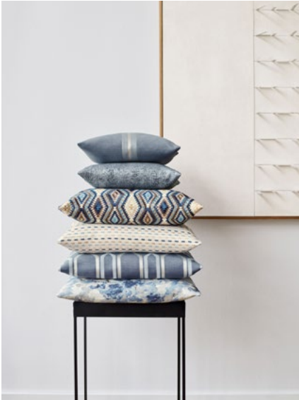
Cushions – from top to bottom Odea 1211, Toto 1214, Asset 1210, Effect 1215, Cone 1212, Smith 1213