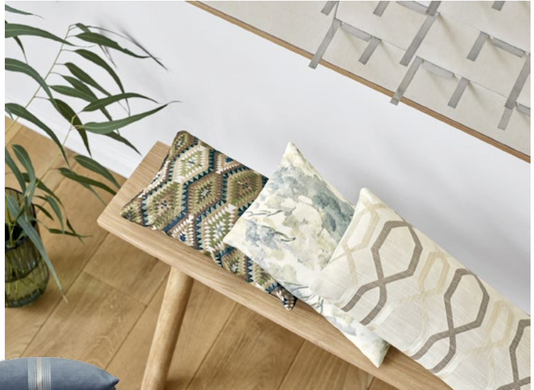
Cushions – from left to right Asset 1210, Smith 1213, Cone 1212